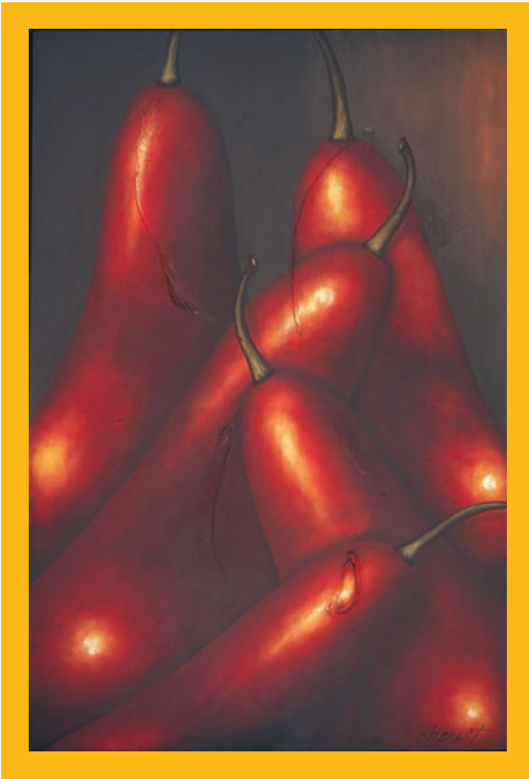
60" X 40" Sky's the Limit